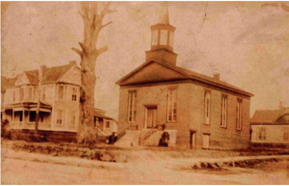
Louisburg Methodist Church